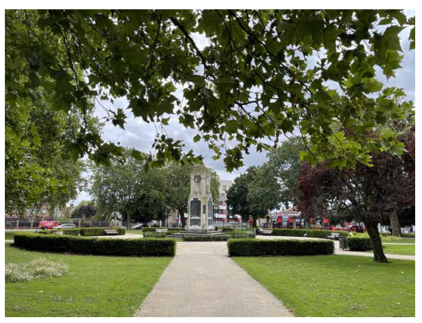
A quiet day at the circle of benches