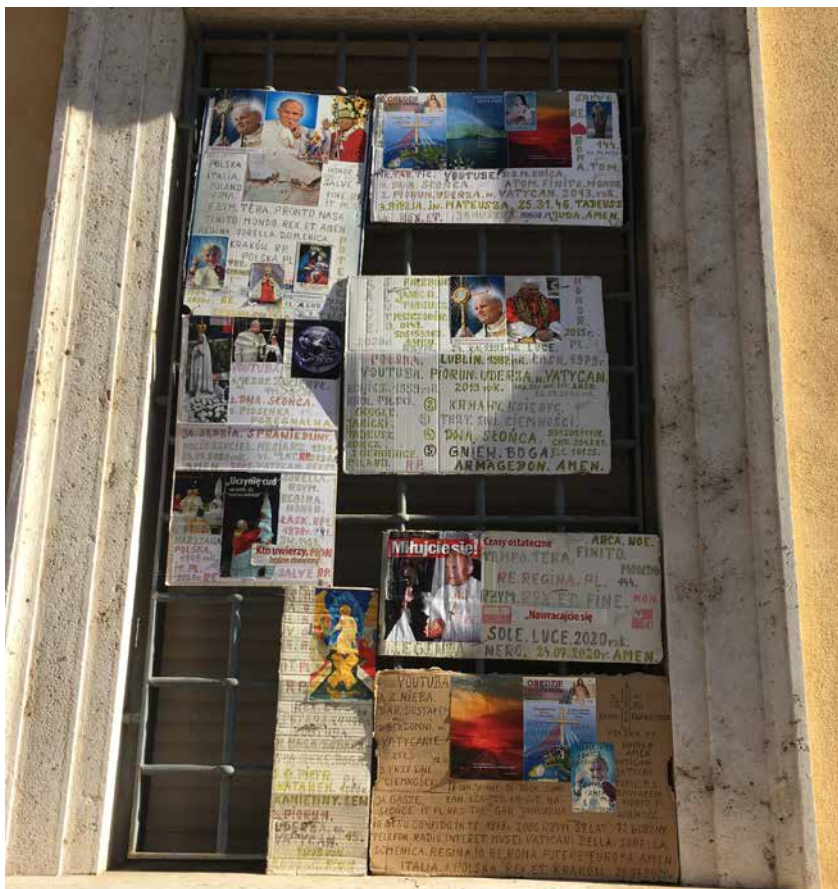
Illustration 1: Images and references to Pope John Paul II made by a homeless person nearby St Peter's Square, Rome