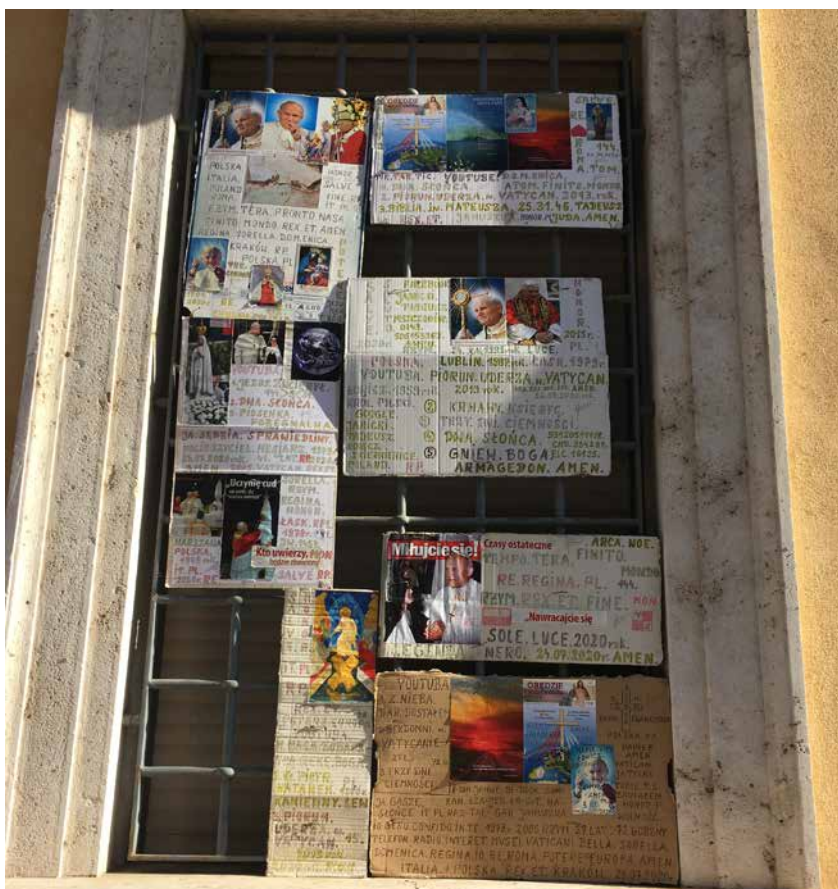
Illustration 1: Images and references to Pope John Paul II made by a homeless person nearby St Peter's Square, Rome