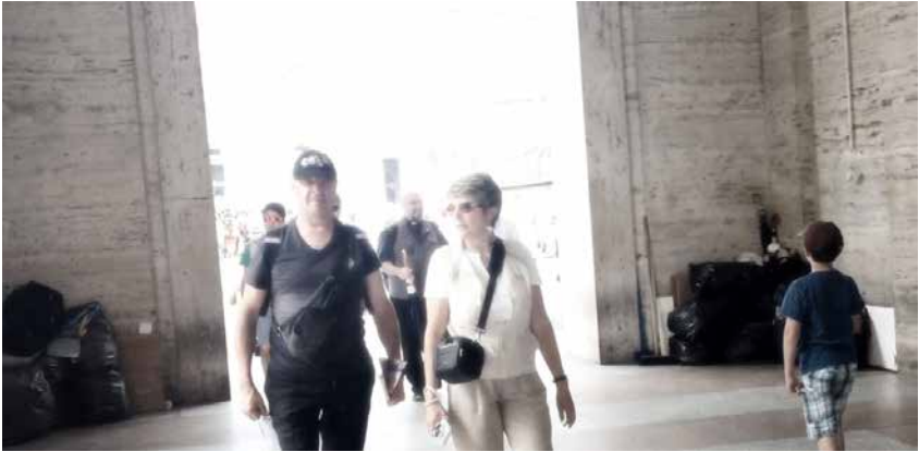
Illustration 2: Homeless people's belonging collected at the corner of the portico in St Peter's Square

come from anywhere, what struck me the most was the presence of a broom. I have enquired the community of homeless inhabitants of the portico about the use and reason for the presence of that object.