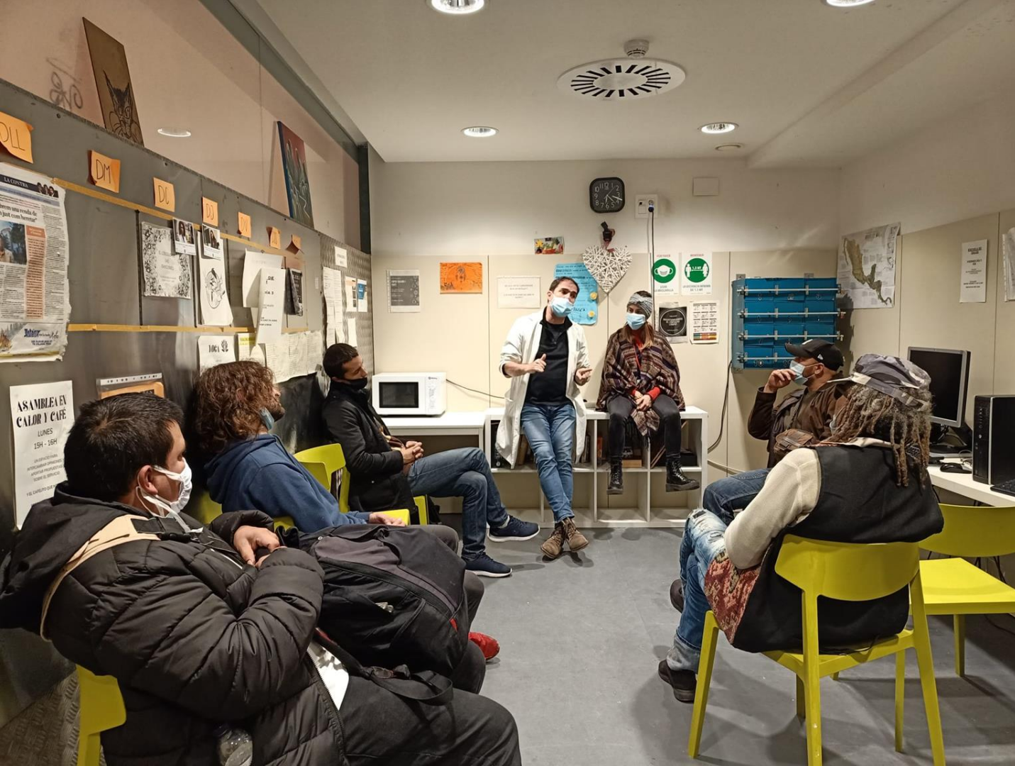
CAS Baluard group activity