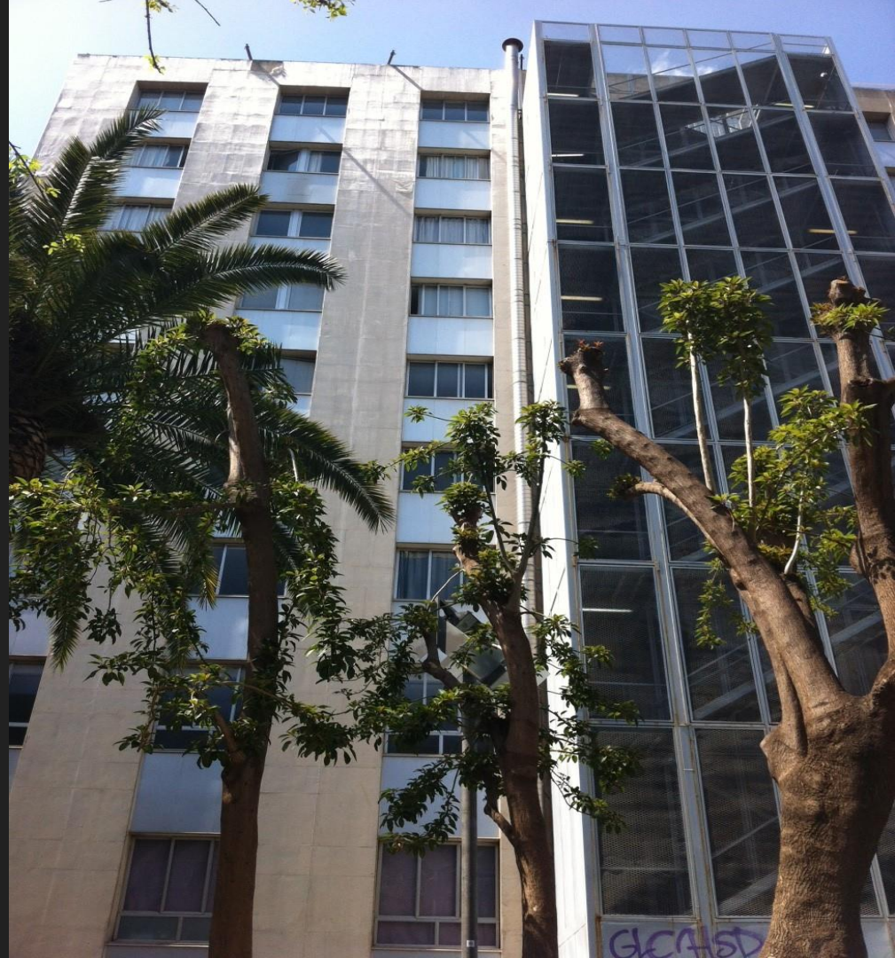
CAP Raval Sud (Drassanes)