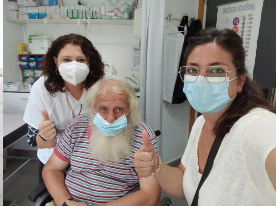
Collaboration between Arrels Foundation and CAP Raval Sud