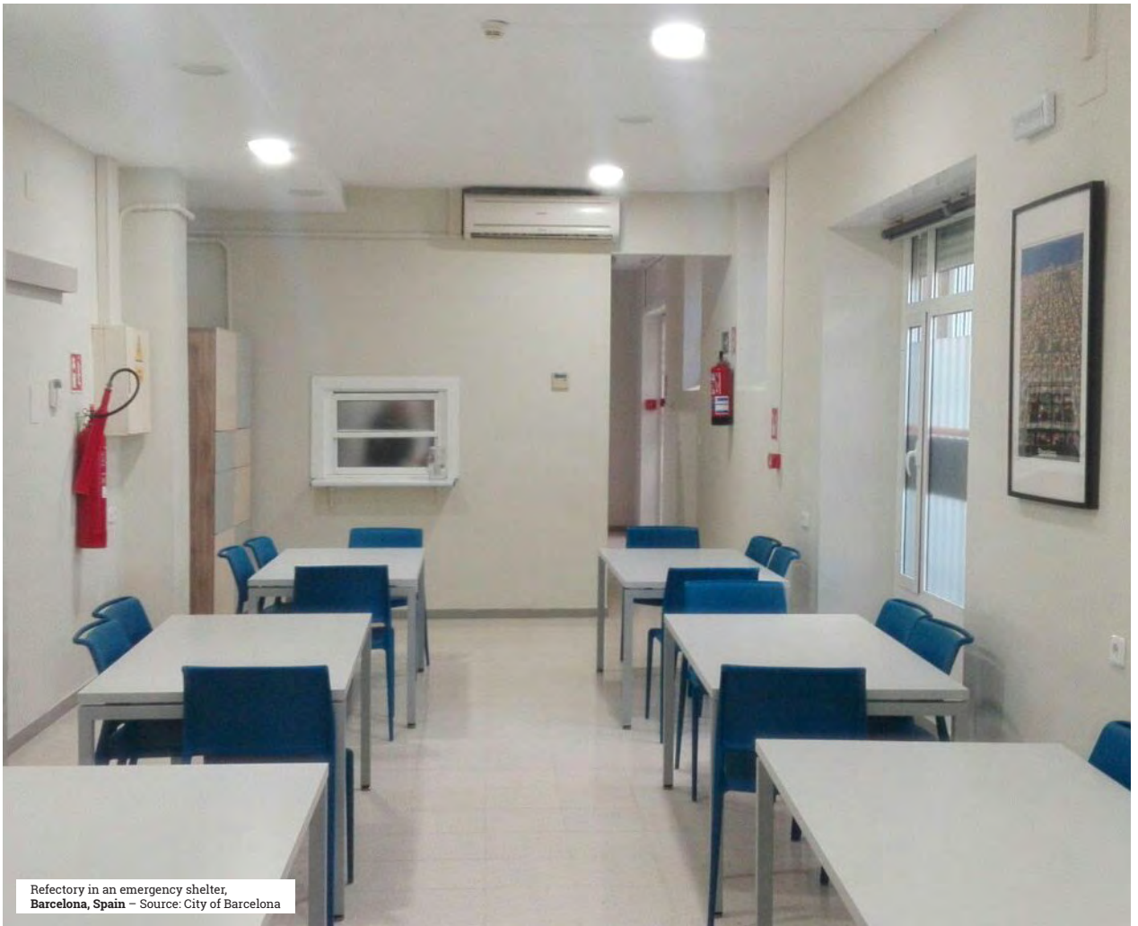
Refectory in an emergency shelter, Barcelona, Spain