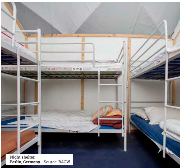
Night shelter, Berlin, Germany