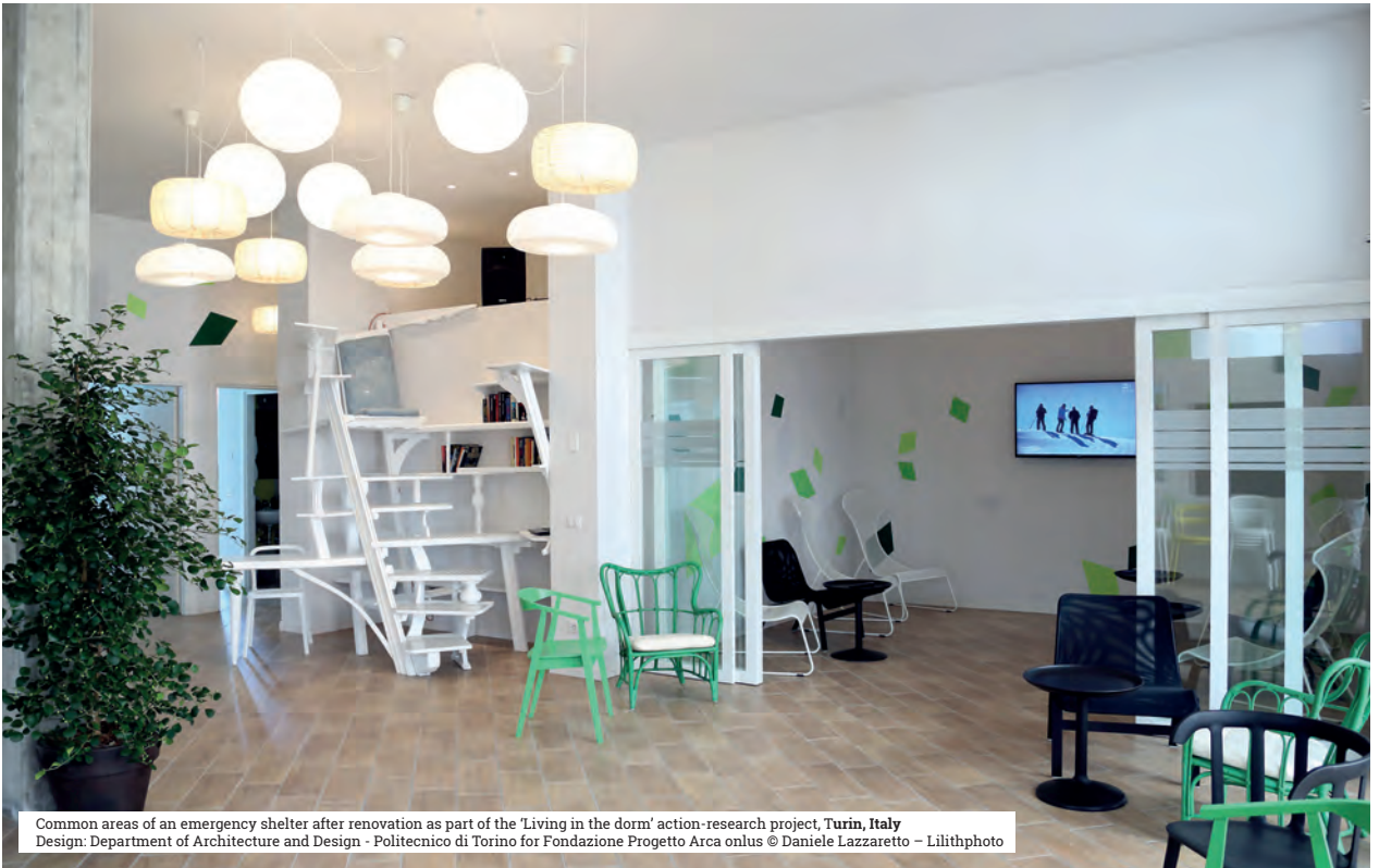
Common areas of an emergency shelter after renovation as part of the 'Living in the dorm' action-research project, Turin, Italy Design: Department of Architecture and Design - Politecnico di Torino for Fondazione Progetto Arca onlus