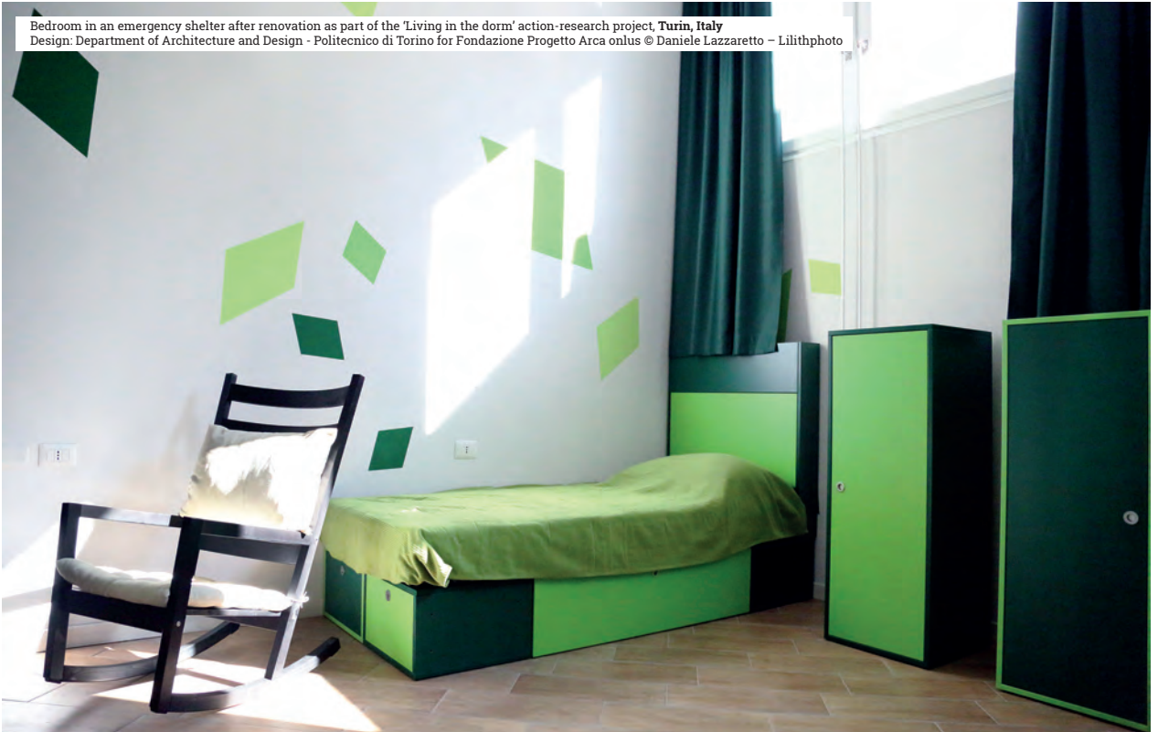
Bedroom in an emergency shelter after renovation as part of the 'Living in the dorm' action-research project, Turin, Italy Design: Department of Architecture and Design - Politecnico di Torino for Fondazione Progetto Arca onlus