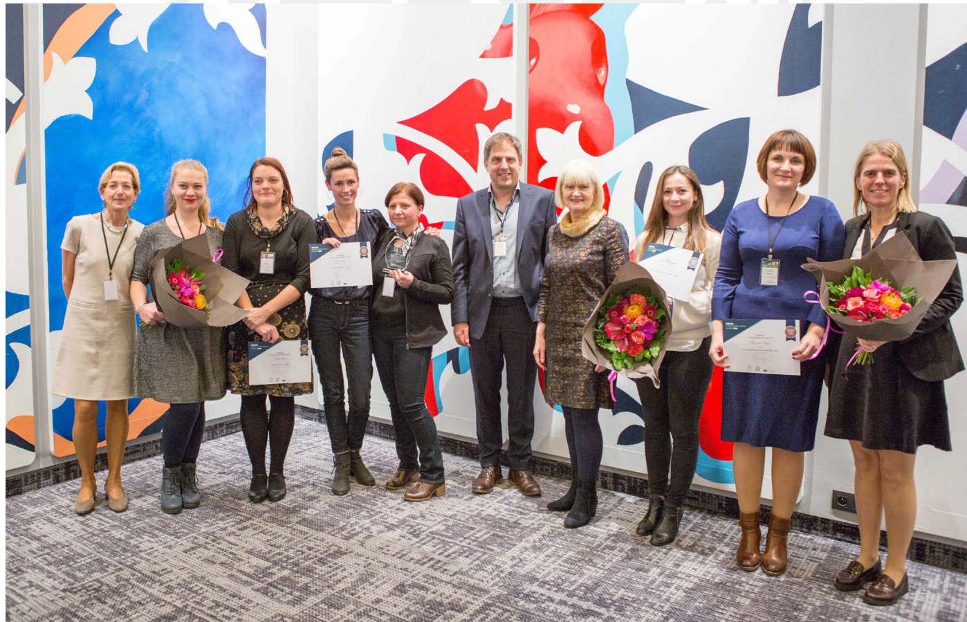
The winners of the FEANTSA Ending Homelessness Awards 2018